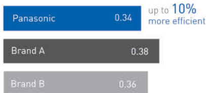
Power Consumption by Capacity [KW/day/box capacity]

Panasonic freezers provide reduced operational cost yielding highly efficient sample storage.