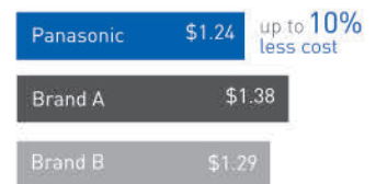
Total Annual Operating Cost by Box Capacity

Cost is an average for operating freezer. The freezers emit heat into the laboratory, minimizing air conditioning costs.