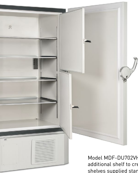
Model MDF-DU702VH-PA shown with one additional shelf to create five levels. Three shelves supplied standard. Additional shelves available.