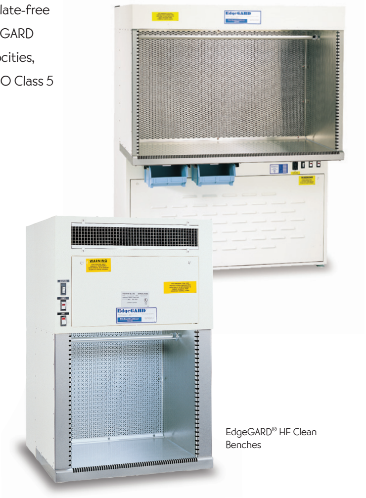
EdgeGARD® HF Clean Benches

NOTE: EdgeGARD clean benches protect product only. They are not designed to contain aerosols generated in the work area and do not protect personnel or the environment.