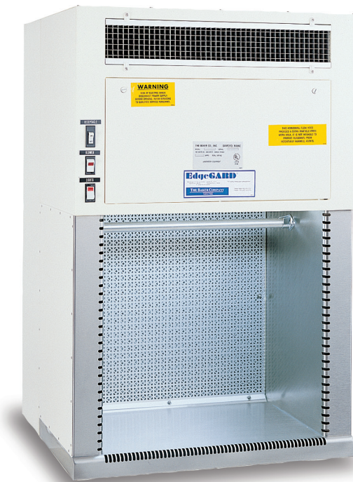
EdgeGARD Model EGBIV22 Space Saver

Laminar airflow across the work surface provides a particulate-free environment for maximum product protection