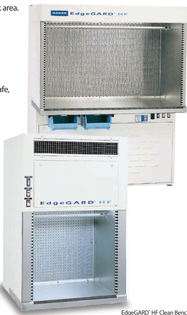
EdgeGARD® HF Clean Benches

NOTE: EdgeGARD clean benches protect product only. They are not designed to contain aerosols generated in the work area and do not protect personnel or the environment.