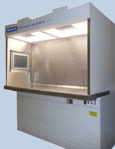
EdgeGARD® HF with PhocusRX®