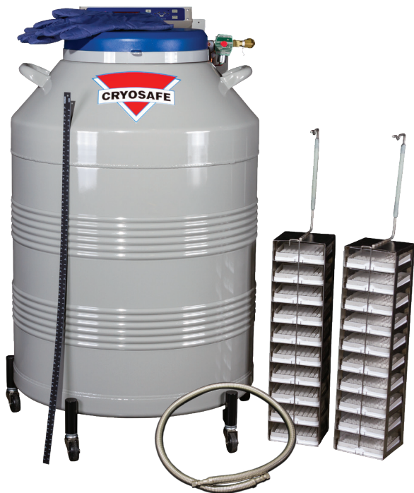
T-Cat 7-IS PS