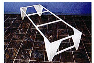
False Frame Included