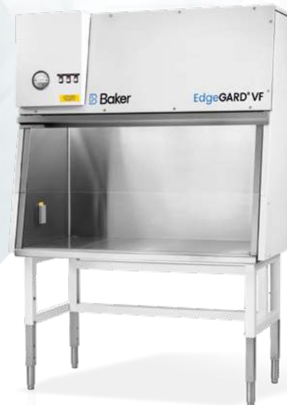
EDGE GARD® VF

The EdgeGARD® VF is a vertical-flow recirculating air clean bench that provides protection for samples and work procedures where product protection and particulate control are required.