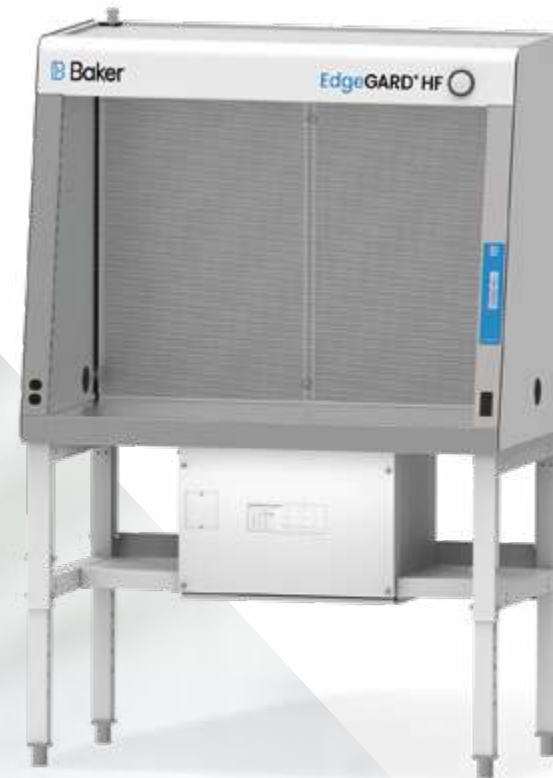
EDGE GARD® E3 HF

Our high-performance laboratory equipment is built with you in mind, with industry-leading ergonomics, energy-efficient engineering, and the lowest life cycle costs available. Baker products help you work more comfortably, boost productivity, save money and minimize environmental impact.